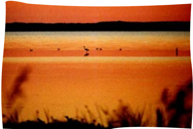
Curonian Lagoon is a paradise for migrating birds.

Service quality: Palanga offers a great variety of food and lodging from campsites to 5-star hotels, but it can't promise peace and quiet as it is visited by hundreds of thousands of people every year.