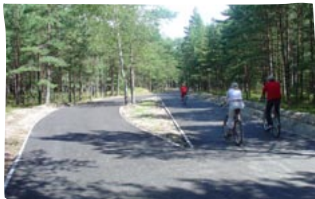
Bicycling route Klaipėda–Palanga.

The Lithuanian Seaside Cycle Route invites cyclist groups and individual travellers to discover the land of three waters: you can choose either to explore this cycle route in its entirety, or continue your trip along other cycle routes (destinations towards Riga or Vilnius). Following are some of the most popular itineraries of the Lithuanian Seaside Cycle Route.