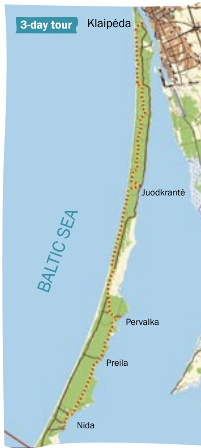
3-day tour Klaipėda