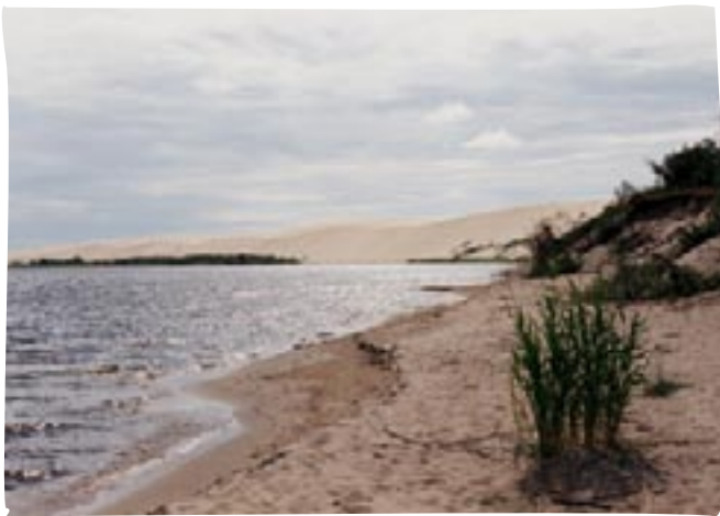
Dunes along the bay shore in Nida.

The Lithuanian Seaside Cycle Route's three sections run in different directions and provide a unique opportunity to explore three ethnographic regions with their particular nature, history and culture.