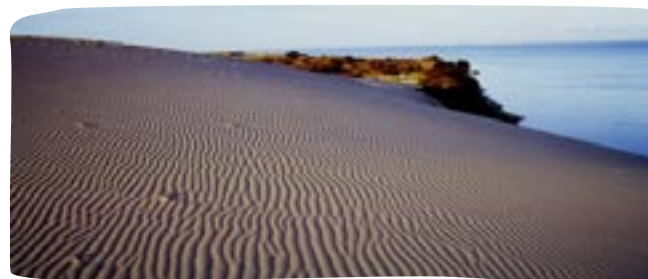
The Great Dune of Parnidis.

Lithuanian Seaside Region explorers can enjoy a great variety of services – from 5-star hotels to cosy and fully equipped campsites. Connections to other parts of world are guaranteed via the Klaipėda International Ferry Port, Palanga International Airport, and the major highways that connect Klaipėda with the capital of Lithuania – Vilnius – which is four hours away by bus. To quote a famous traveller, Wilhelm von Humboldt, almost 200 years ago: “Visiting this place is a must, the same as seeing Spain or Italy.”