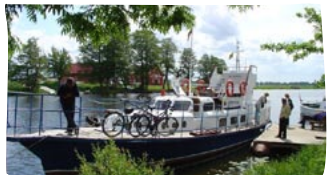
Specially reserved boat takes cyclists from Minija to Nida.