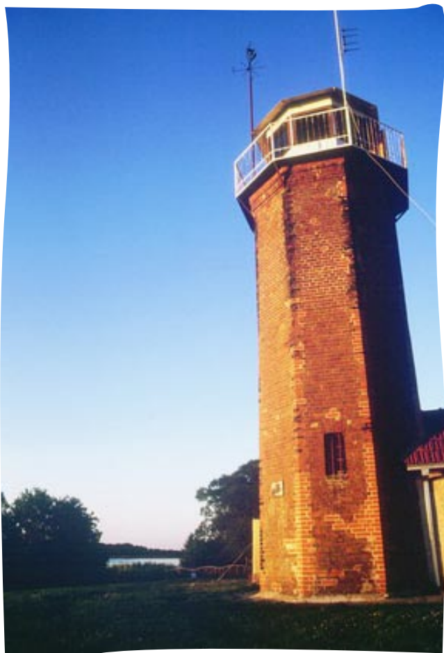
A 19 th -century lighthouse in Uostadvaris.

Specialised publications for cyclists, which can be ordered from the BaltiCCycle virtual map store on www.bicycle.lt or from local tourist information centres: