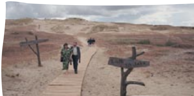
Cognitive path through the Dead Dunes near Pervalka.

Inland sights: Ventės Ragas Ornithological Station and an 19 th century lighthouse, Minija (Mingė) Village – the Venice of Lithuania, the I. Simonaitytė Memorial Museum in Priekulė. Overnight stay in Juodkrantė (one night) and Nida (one or two nights) when the return route is a) or c) and Ventė / Kintai (one night) when the return route is b).